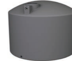
BT18000 18,000L/4,000gal Height 2,580mm Diameter 3,350mm Outlet 40mm Overflow 90mm