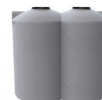
BTS5000 5,000L/1,100gal Height 2,100mm Width 2,300mm Depth 1,350mm Overflow 90mm Outlet 25mm