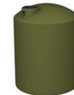
BT2275 2,275L/500gal Height 1,770mm Diameter 1,400mm Outlet 25mm Overflow 50mm