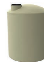
BT5000-T 5,000L/1100gal (Tall) Height 2,250mm Diameter 1,800mm Outlet 25mm Overflow 90mm