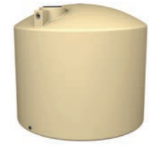
BT22500-T 22,500L/5,000gal (Tall) Height 3,000mm Diameter 3,350mm Outlet 40mm Overflow 90mm