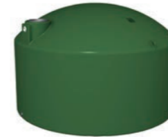
BT22500-S 22,500L/5,000gal (Squat) Height 2,500mm Diameter 3,800mm Outlet 40mm Overflow 90mm Inlet 2,250mm