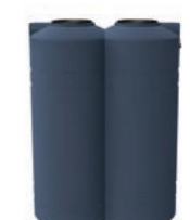
BTS2000 2,000L/440gal Height 2,100mm Width 1,550mm Depth 875mm Overflow 90mm Outlet 25mm