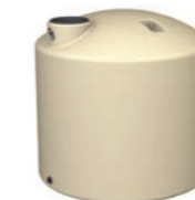
BT5000-S 5,000L/1,100gal (Squat) Height 1,900mm Diameter 2,000mm Outlet 25mm Overflow 90mm Inlet 1,850mm