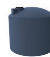
BT13500 13,500L/3000gal Height 2,500mm Diameter 2,800mm Outlet 40mm Overflow 90mm