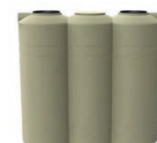
BTS3000 3,000L/660gal Height 2,100mm Width 2,300mm Depth 875mm Overflow 90mm Outlet 25mm