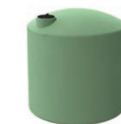
BT1800 1,800L/400gal Height 1,470mm Diameter 1,400mm Outlet 25mm Overflow 50mm