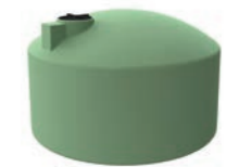
BT9000 9000L/2000gal Height 1,790mm Diameter 2,800mm Outlet 40mm Overflow 90mm