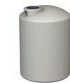
BT900 900L/200gal Height 1,450mm Diameter 1,000mm Outlet 25mm Overflow 50mm