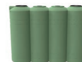
BTS4000 4,000L/880gal Height 2,100mm Width 2,900mm Depth 875mm Overflow 90mm Outlet 25mm