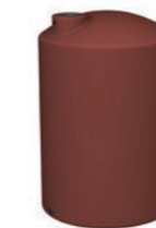
BT3000-T 3,000L/660gal (Tall) Height 2,100mm Diameter 1,400mm Outlet 25mm Overflow 50mm